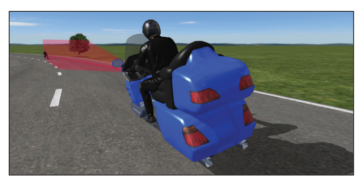
Sensor feature for developing active safety systems