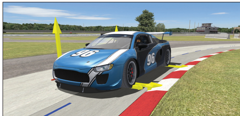
Closed-loop driver model and detailed road profile